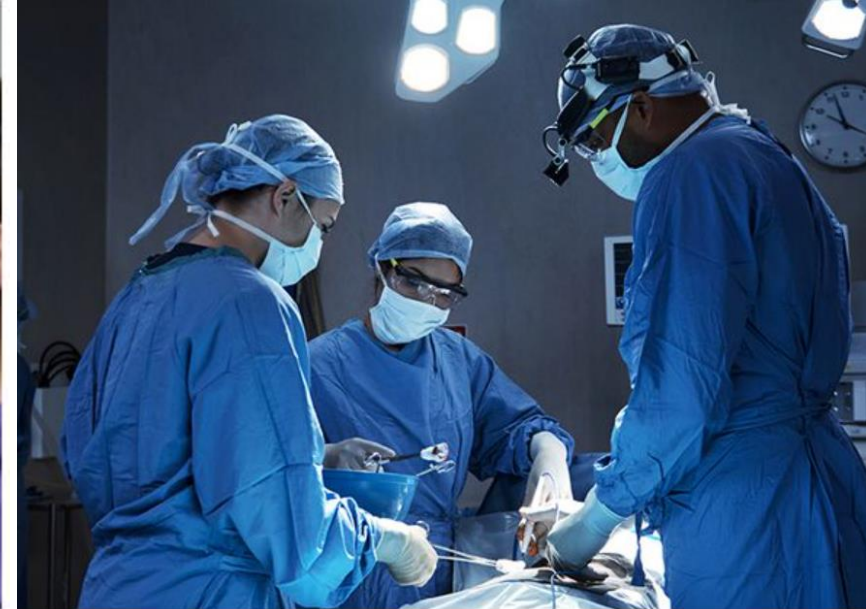
Operating Department Practice (ODP)